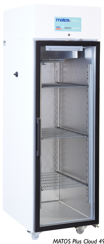
MATOS Plus Cloud 493 R/GDT

Cloud 493 R/DT - Solid Door, with hot gas defrost Cloud 493 R/GDT - Glass Door, with hot gas defrost